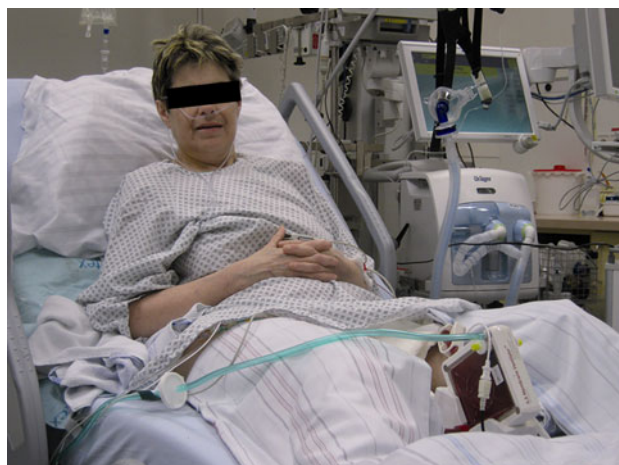
Fig. 3 Spontaneously breathing patient with an acute exacerbation of COPD receiving ventilatory support from a PECLA. The venous cannula is inserted in the right femoral vein, and the arterial cannula is placed in the left femoral artery (the patient gave consent for publication of this picture)

Of course, the limitations and side effects of a pumpless extracorporeal lung assist need to be discussed. First, because the PECLA is a pumpless device, a cardiac index greater than 3 l/min/m 2 and a mean arterial pressure above 70 mmHg are necessary to allow for the circulatory tolerance of an artificial arterio-venous shunt of up to 25 % of cardiac output. Second, the arterial cannulation can cause vascular complications. Episodes of lower limb ischaemia from arterial cannulation were frequently observed in the early period after introduction of the PECLA when large (17–19 French) cannulas were used